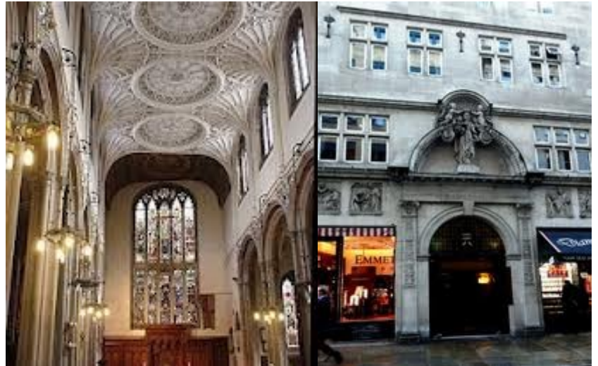
St Mary Moorfields, EC2M 7LS

The church is situated between Moorgate and Liverpool Street underground stations.