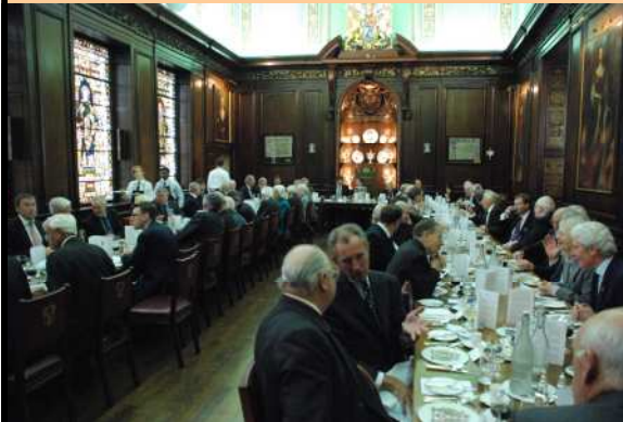
Enjoying lunch in Tallow Chandlers' Hall after the Election of the Lord Mayor in 2010

The Livery Lunch is a fairly recent initiative, that provides Liverymen an opportunity to bring their wives, husbands or partners to meet each other and enjoy a good lunch in a much less formal atmosphere than, say, at the Banquet. Previous lunches have been very popular