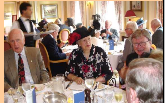
Last year's Livery Lunch

and have been held at the Cavalry and Guards Club in Piccadilly, but this year we will meet at the splendid Tallow Chandlers' Hall in the City. Many Liverymen will know this hall, and have enjoyed its hospitality, but for