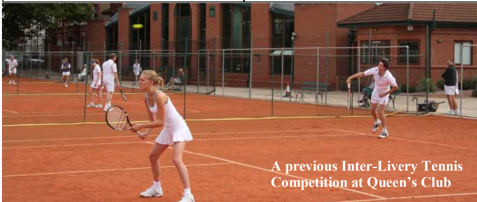
A previous Inter-Livery Tennis Competition at Queen's Club

Inter-Livery Tennis Competition at Queen's Club